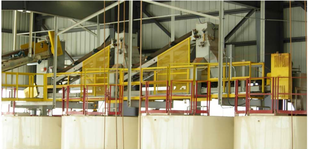
TRIPPER CONVEYOR FEEDING SILOS IN BRICK PLANT

INNOVATIVE PROCESSING SOLUTIONS fixed tripper conveyors allow for multiple discharge point on bulk handling conveyors with minimal maintenance.