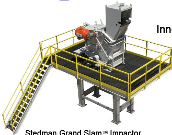
Stedman Grand Slam™ Impactor Mounted on an Innovative Processing Solutions designed Support Structure

Innovative Processing Solutions Structures designed to fit the STEDMAN™ line of GrandSlam™ Impactors