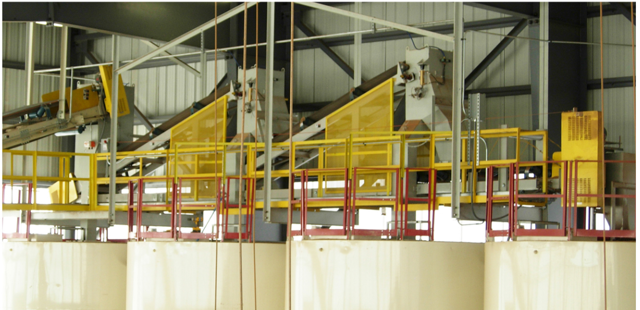
TRIPPER CONVEYOR FEEDING SILOS IN BRICK PLANT

INNOVATIVE PROCESSING SOLUTIONS fixed tripper conveyors allow for multiple discharge point on bulk handling conveyors with minimal maintenance.